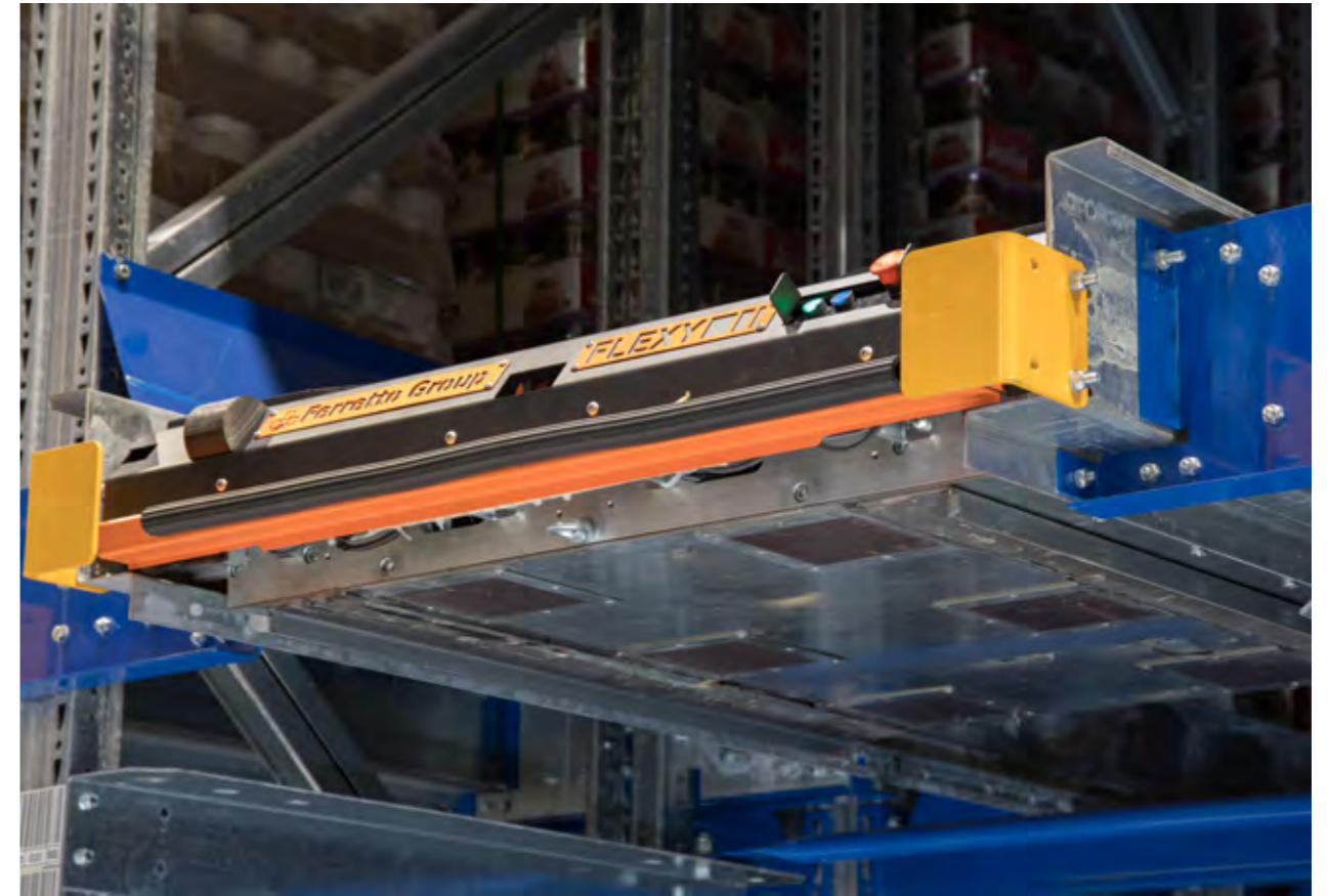
Close-up of pallet picking with Flexy satellite